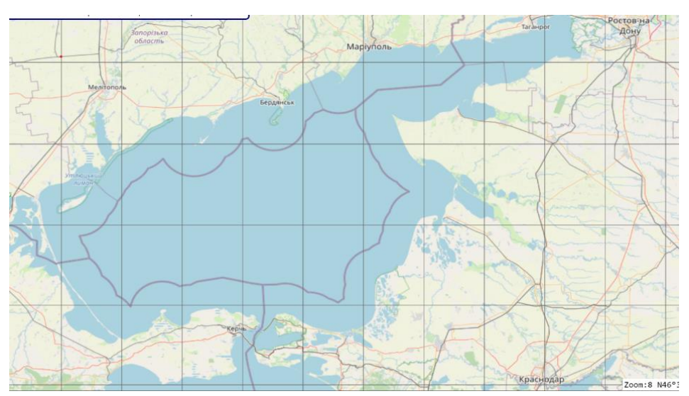
Figure 2: Sea of Azov Maritime Border Map.